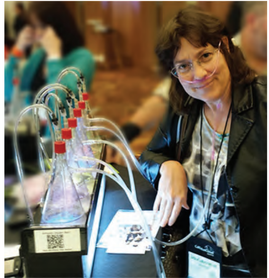
The author enjoys a breath of fresh oxygen at DevLearn13, Las Vegas

The bulk of the programming day consisted of numerous concurrent sessions, up to twenty to choose from, held in various conference rooms. Typically these sessions addressed some aspect of learning theory, design, analytics, and best practices. Competing with these were a scheduled series of demos in the Expo Hall, a crowded affair with over 100 exhibitors offering everything from custom eLearning development to technologies for developing and delivering your own content. At the rear of the Expo Hall were three stages that offered presentations focused on eLearning tools, emerging technologies, and mobile learning solutions. Personally, I found the demo on how to introduce interactivity to my Storyline videos to be the most immediately useful, and I plan to integrate these techniques into my next course.